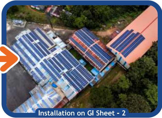
Installation on GI Sheet - 2