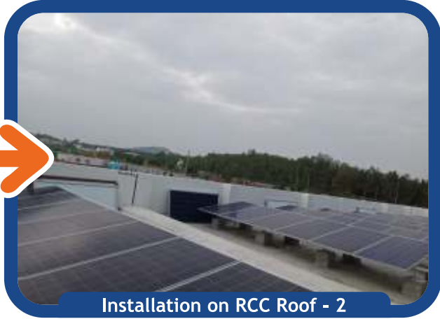
Installation on RCC Roof - 2