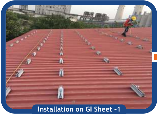
Installation on GI Sheet - 1