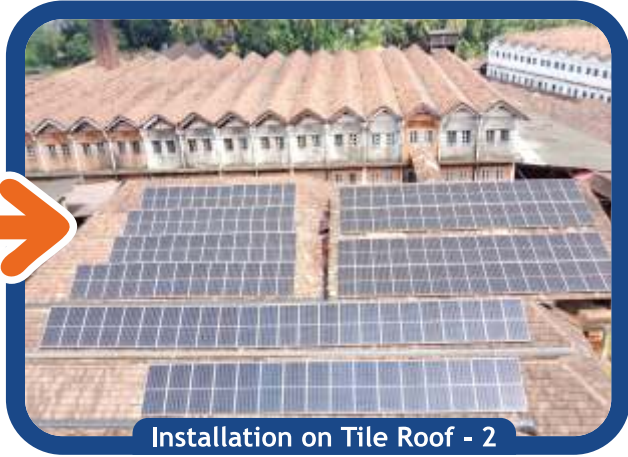
Installation on Tile Roof - 2