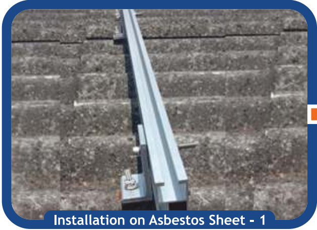
Installation on Asbestos Sheet - 1