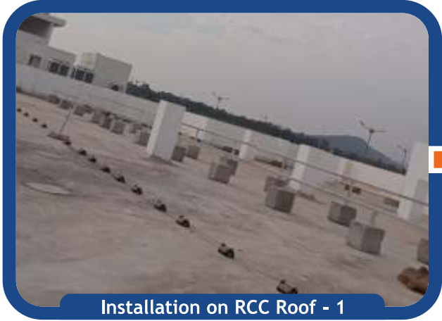
Installation on RCC Roof - 1