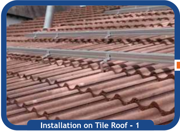
Installation on Tile Roof - 1