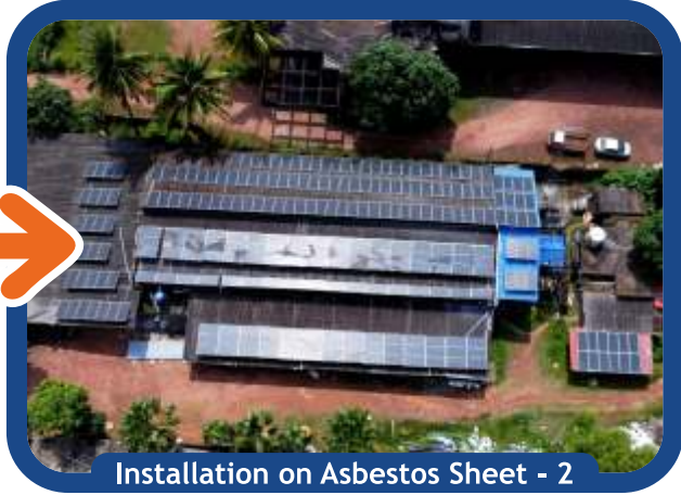
Installation on Asbestos Sheet - 2